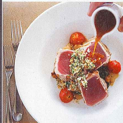
Clockwise from left: The bar scene at Sylvain in the French Quarter; Elegant seared tuna at Mesón 923; The incomparable Emeril Lagasse.